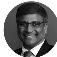
DR. SETHURAMAN PANCHANATHAN

Director, GigEagle Agile Talent Ecosystem Initiative, DOD